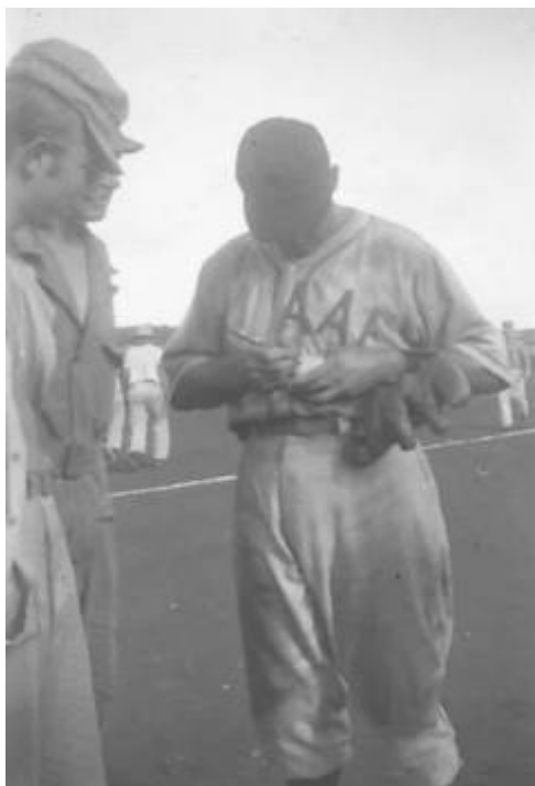
Enos Slaughter of the 58th Wingmen signs baseballs for fans.