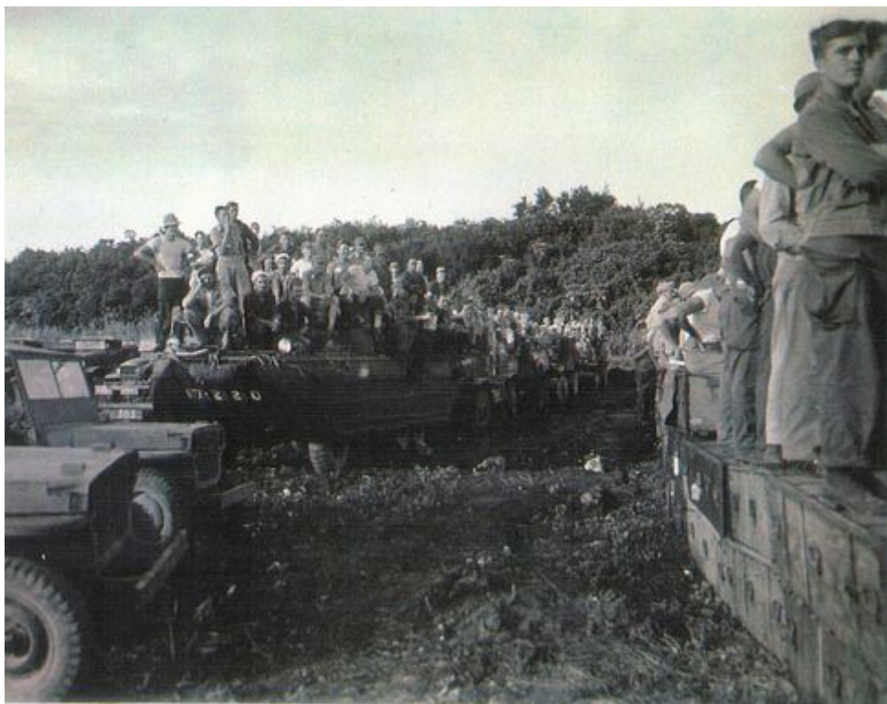
"They'd just bring in the Army trucks and jeeps and so forth and park 'em around the outfield grass."

the bomb crates back 10 to 20 feet. With the other Tinian club [313 th Flyers] we would move the bomb crate fence in depending on who was pitching."