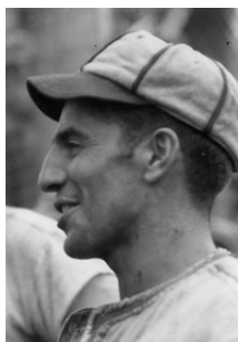
Phil Rizzuto 1917-2007

Furthermore, there are a couple of book proposals in the pipeline, and I will be in Cooperstown, NY, in mid-January. So 2008 looks to be another busy year!