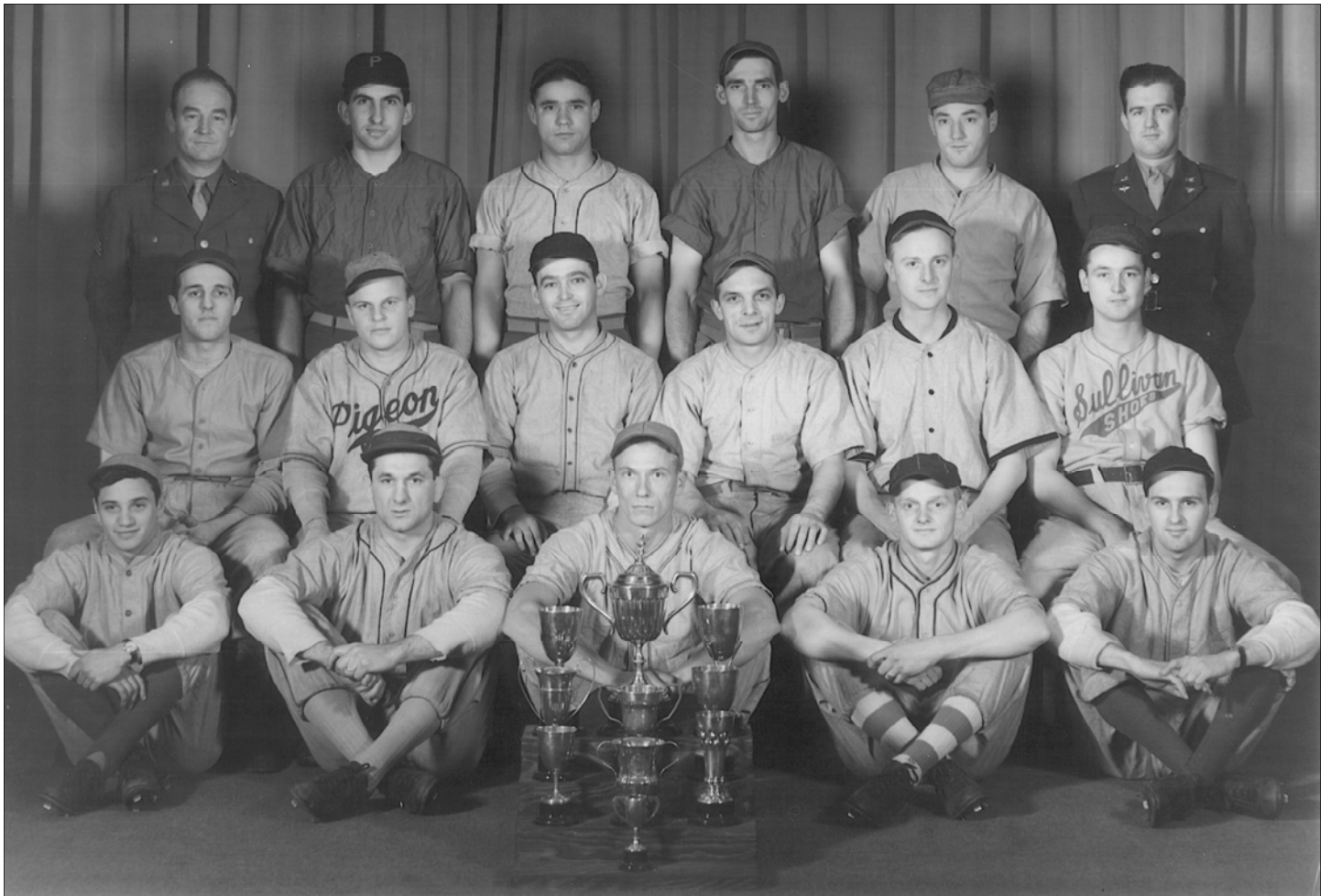
The 988th MP Fliers with their 1943 silverware.