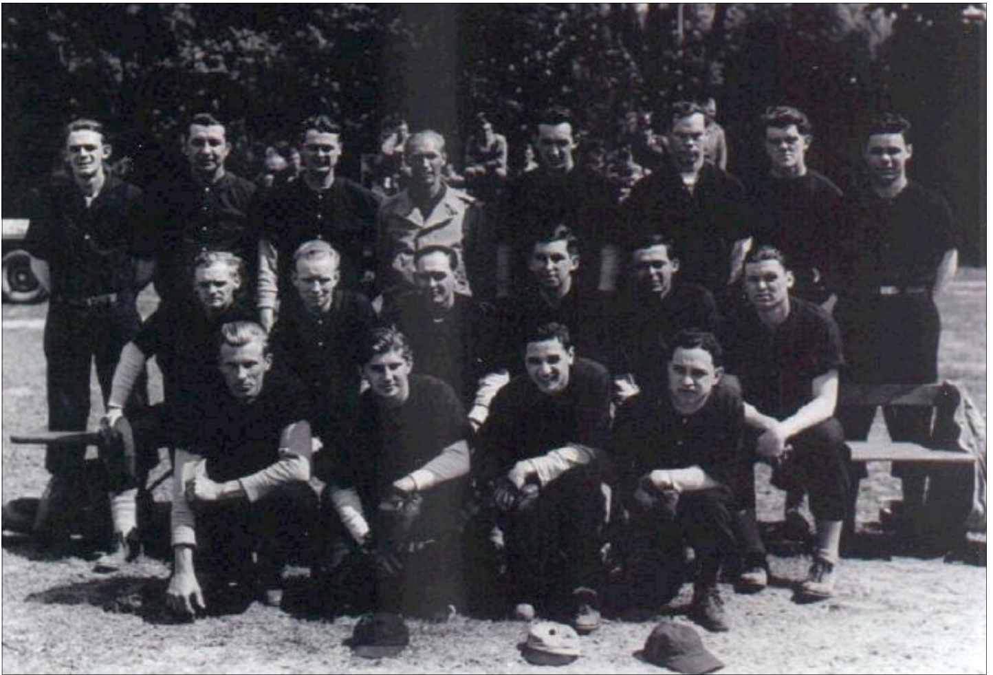
The 988th MP Fliers in France, 1945