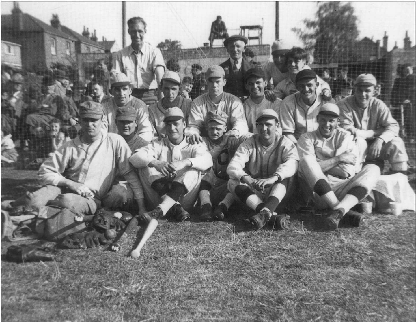
The 988th MP Fliers