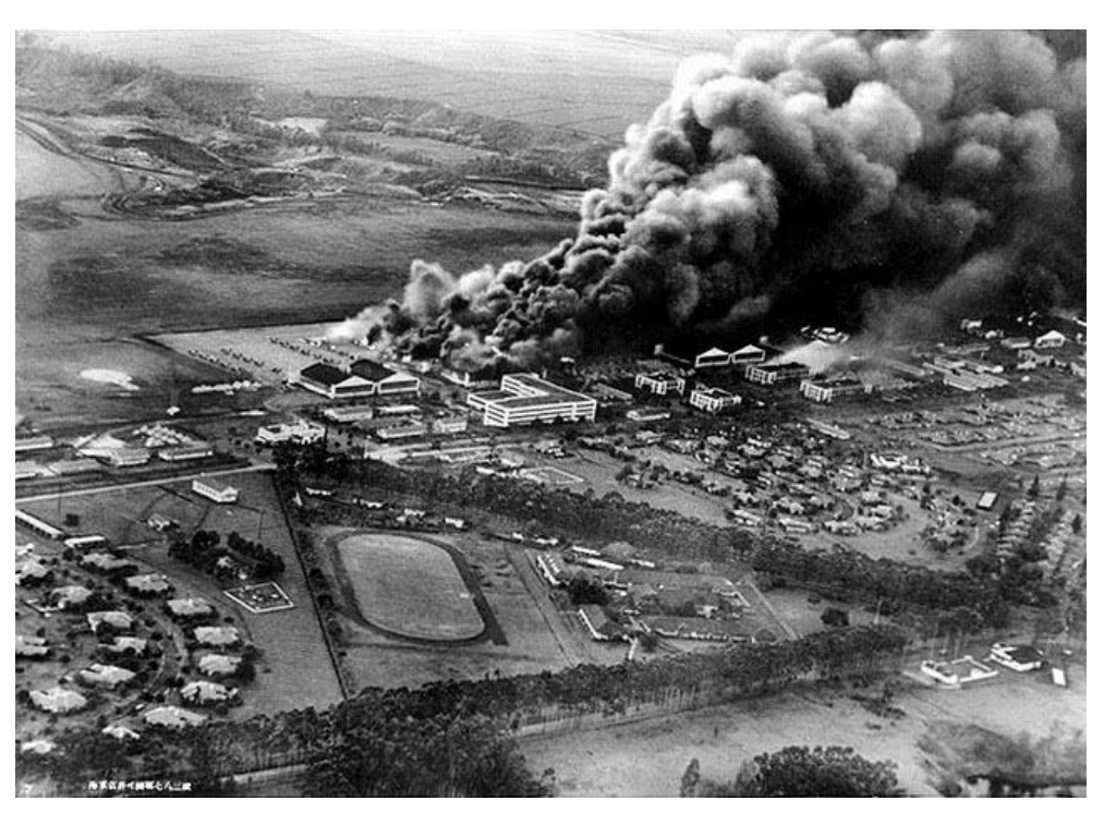
Hickam Field burns during the Japanese attack, December 7, 1941