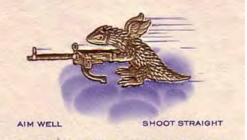
LAS VEGAS ARMY GUNNERY SCHOOL LAS VEGAS, NEVADA

For the semi-pro finals, the Horned Toads made the journey to Wichita, Kansas by plane. But their winning streak soon came to an end as they were beaten, 7-1, by the 326<sup>th</sup> Glider Squadron from Alliance, Nebraska, on August 17 and then eliminated in a 10-2 rout by the Fort Riley Centaurs the following day.