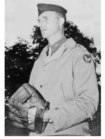
Former Washington Senators' pitcher Montie Weaver was the coach of the Eighth Air Force All-Stars in England in 1943.

In 1988, Gaston was inducted into the Rome-Floyd County Sports Hall of Fame. He passed away in Lindale, Georgia, on September 26, 1994, aged 83.